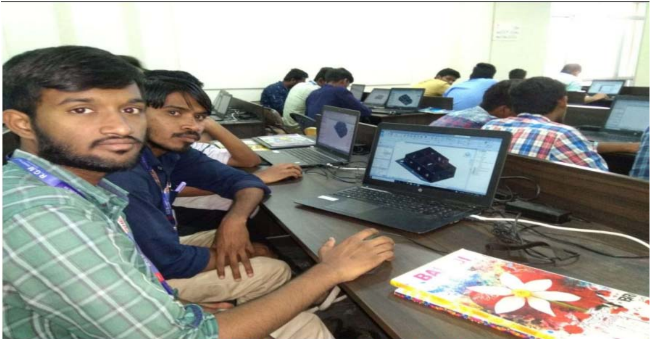
Practiced diagrams of the students