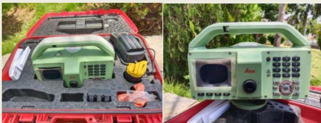
Digital Level Leica LS10 instrument