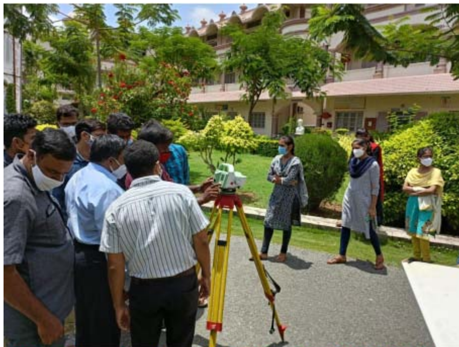
Civil Engineering Department Teaching Staff Members