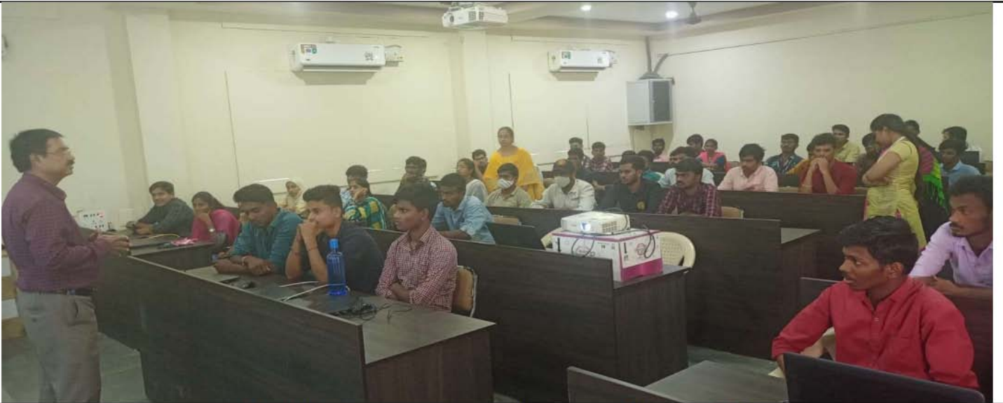
HOD Civil addressing the students regarding workshop